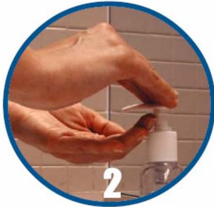
2 Use Soap