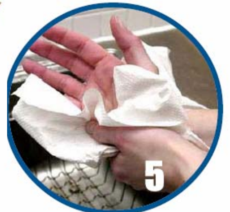
5 Dry Hands