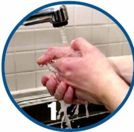
1 Wet Hands